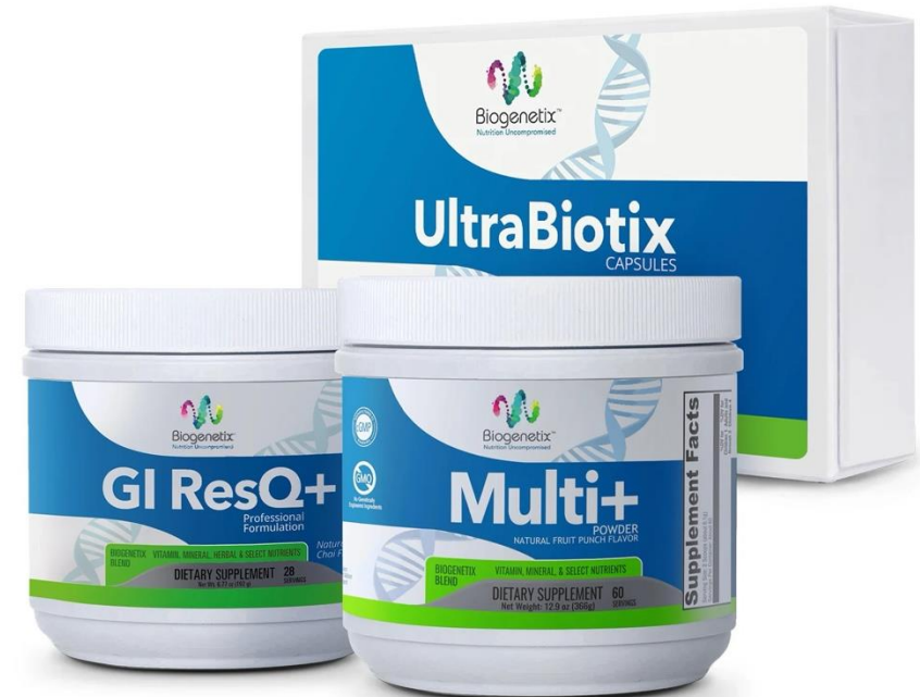
GI ResQ+ Bundle