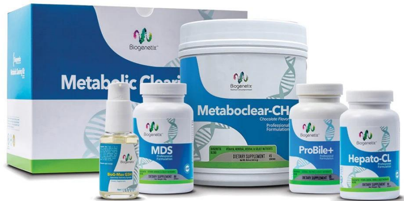
21 day MCP with Binder Pro